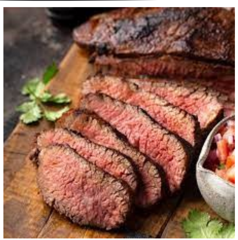
Tri Tip, 2 sides, salad, rolls and desert.