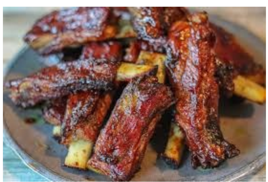
BBQed Ribs and all the fixins